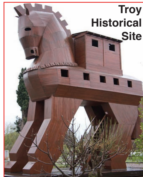
Troy Historical Site