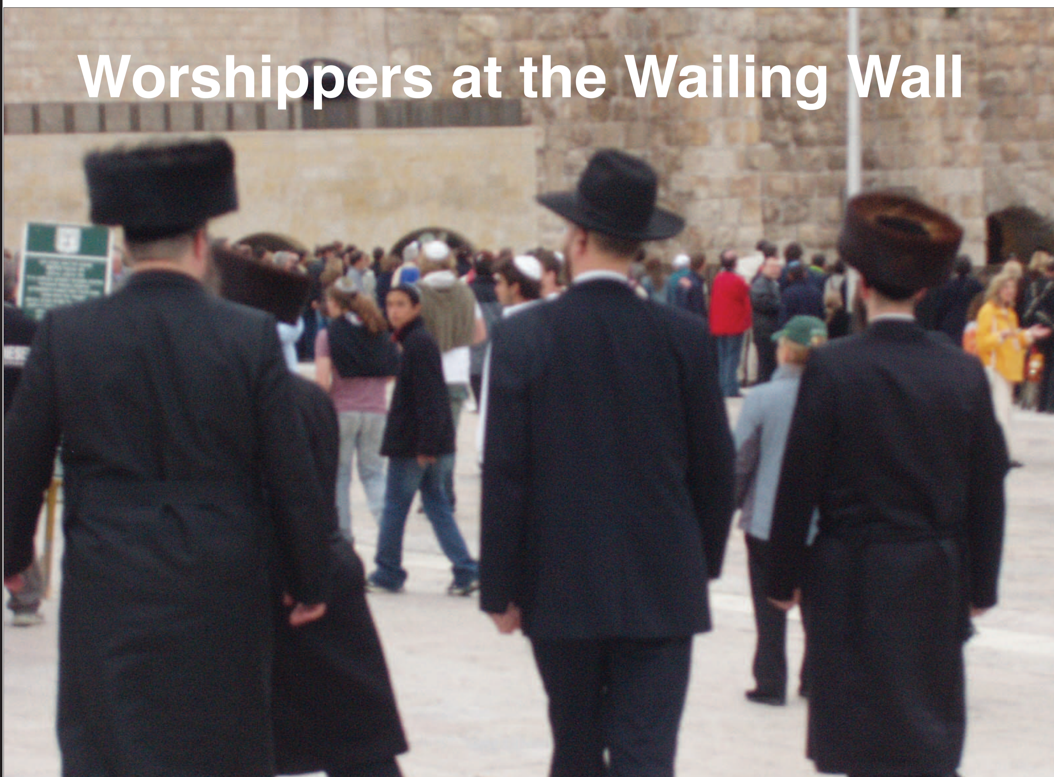
Worshippers at the Wailing Wall

19 Days of Christian Pilgrimage that will enhance your faith in ways you could never imagine