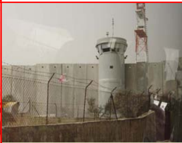
Bethlehem dividing Wall