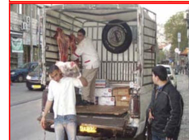
Every day life