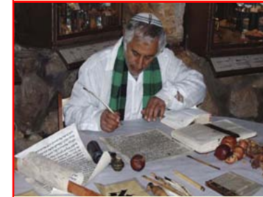
A day in the life of...