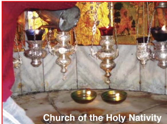
Church of the Holy Nativity