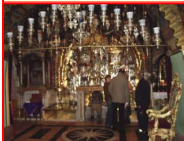
Church of the Holy Sepulchre