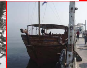
Sea of Galilee